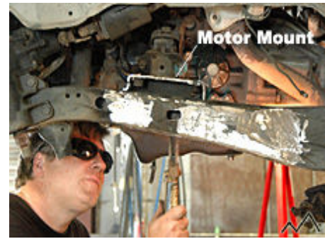
IFS Brackets Ground Off