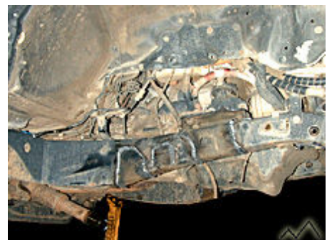
IFS Suspension Removed

Unbolt and remove the front axle half shafts, differential, idler arm, tie rod, A-arms, sway bars and torsion bars. Using a torch or plasma cutter, cut off the A-arm mounting brackets. Once removed, use a grinder to remove the remnants of the brackets. Grind until frame is completely smooth and flat (see photo). When removing the the A-arms, part of the engine motor mounts will be removed. This is normal and later, plates will be installed to fill the void created by removing the IFS suspension. Remove as little of the motor mount as possible.