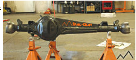
Front Gusset and Armor Installed

The upper axle gusset is installed on top of the axle. Place the gusset on the axle and tap lightly with a hammer to seat it on to the axle. Make note of where the gusset contacts the axle and remove all paint and grease from the axle housing. Weld gusset in place using 1" stitch welds.