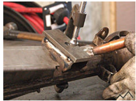
Driver Side Front Spring Pad

A small 3/8" thick pad is provided for the driver side (left) spring perch. This pad raises the spring mounting surface to match the passenger side. Weld the spring pad onto the left front axle spring perch. Weld across the front and back. Do not weld the sides so that the pad can be removed with a grinder if needed in the future.