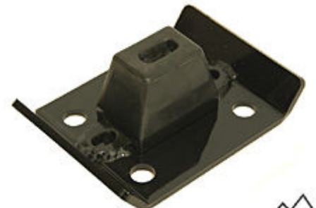
Bumpstop &amp; Flip Plate Welded Together

The end of the spring that has a full double wrap goes in front. Hold spring in place, then slide 120mm long greasable bolts through spring and hanger. Grease the exposed threads of the of the bolt before installing the crimp nuts.