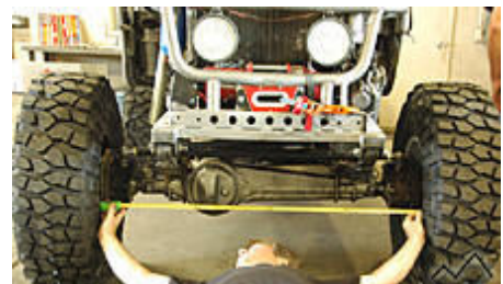
Stetting Tie Rod Adjustment

Place the steering wheel so that it is in the center of it's movement left to right. Bolt on the pitman arm using the stock nut and washer. Connect the left side of the steering Drag Link to the the front most hole in the right side steering arm. Tie rod ends should have approximately 3 three exposed threads. Do not expose more than 1/2 of the tie rod end threads as this can cause an unsafe driving condition.