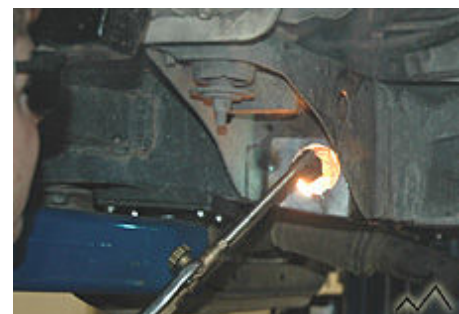
Frame Tube Hole Cutting