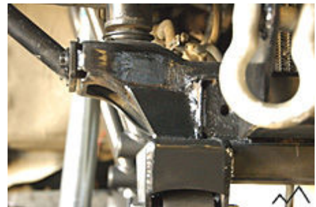
Front Hanger Gussets