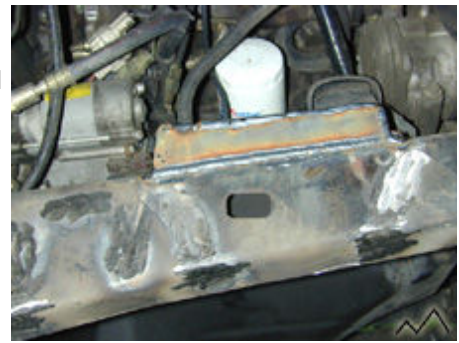
Motor Mount Plate

Install shocks and hoops so that approximately 60% of the shock is in the tube and 40% is out or as close to this as you can. Exact positioning will depend on spring height, vehicle weight, and shock choice. Shocks should be mounted vertically with the "Can" or body of the shock in the up position.