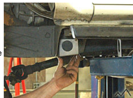
Frame Tube Jig Placement

Place the frame jig onto the frame and center the jig in the body mount under the firewall. Mark or scribe both the inside and outside of the frame rails. Using a plasma cutter or torch, cut the holes through the frame. The jigs can also be tacked into place and used as a guide during cutting. Slide each frame tube into the frame. Center the frame tube in its hole. After centering the tube, push the tube toward the outside of the frame 1/4". Now weld the frame tube in place. Now do the other frame tube, centering it up and then pushing it out 1/4" before welding in place. Weld both the inside and outside of the frame around the shackle tube.